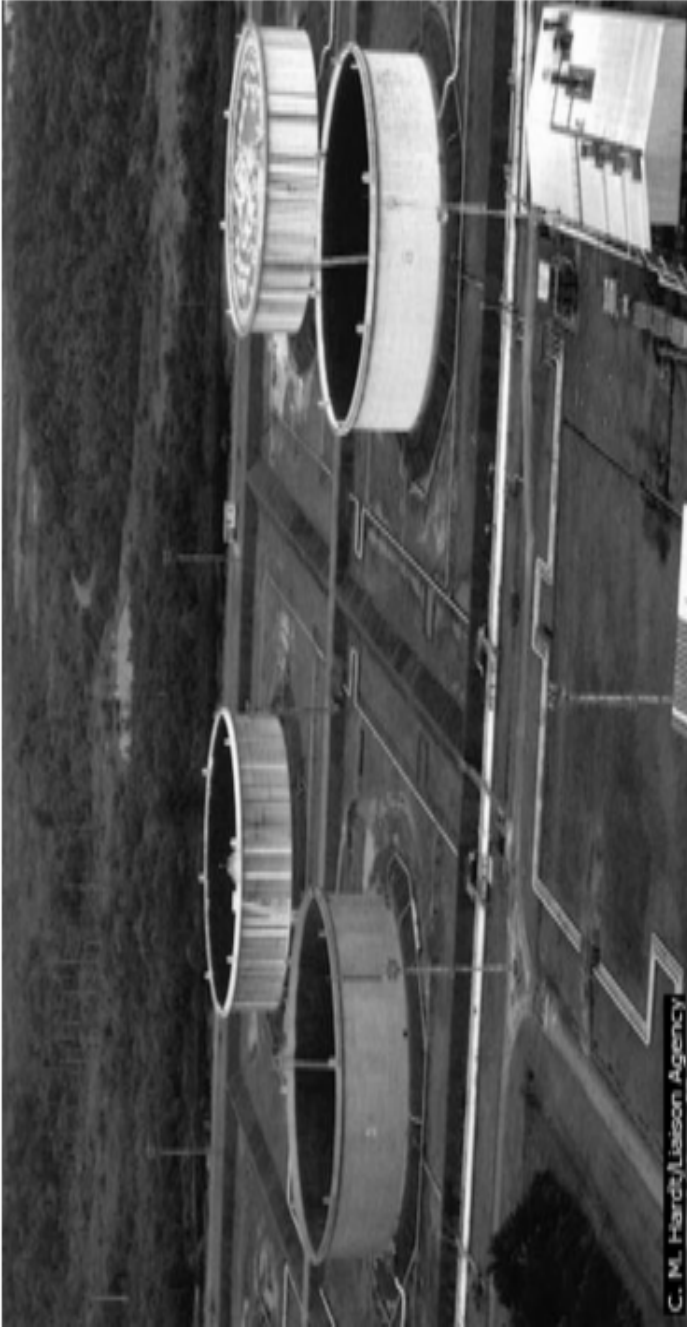
Oil Storage Tanks, Nigeria: Nigeria ranks as a major exporter of oil. At Brass, on the southern tip of the Niger Delta, oil is held for export in these huge tanks. Surrounded by significant oil fields and adjacent to large seaports, Brass provides a convenient storage point.