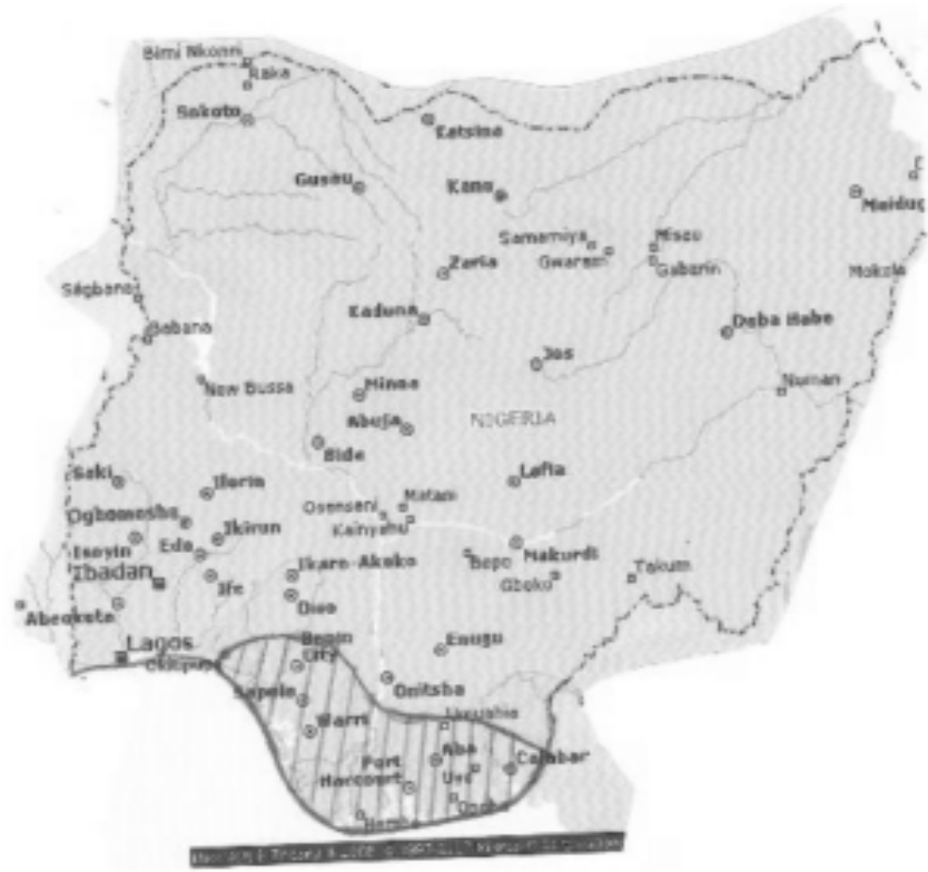
Figure 1: Map of Nigeria. The shaded area represents the oil producing Niger Delta region.