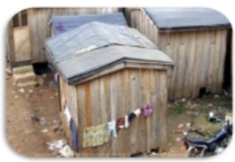
Plate 1: Nature and Condition of Housing Structure

buildings were wooden and the buildings had latex roofs. The condition of the remaining 5.1 per cent of the houses was average since they were made of concrete but had corroded roofing sheets with some having exposed foundations. The bad condition of the houses in the two communities could be attributed to lack of maintenance as well as fear of losing investments due to evictions. These evidences support the widely held literature that, housing condition, slum areas are dilapidated.