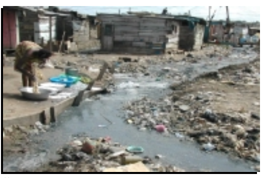
Plate 3: Liquid Waste Disposal in Slums

Drainage: From the study, it was evidenced that both communities had poor drainage systems as there were no proper drainage channels. As a result, liquid waste was disposed in the open space causing stagnation. The stagnation of the liquid waste serves as breeding places for mosquitoes. Furthermore, it was realised that the dwellers of both communities create trenches in the ground to enhance flow of liquid waste from their homes. Further analysis disclosed that the clustered nature of housing within these communities made it difficult and impossible for proper and safe drainage systems to be provided in the two communities.