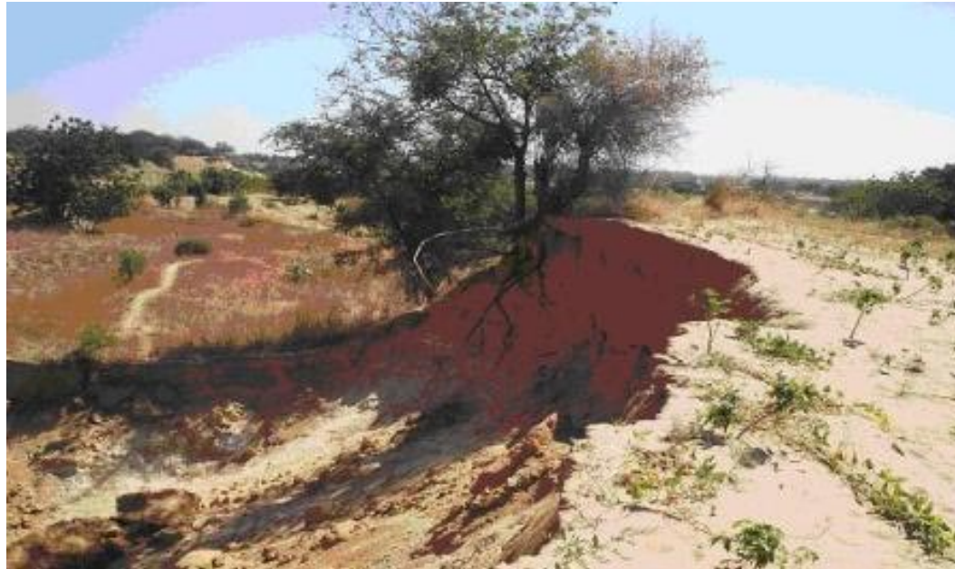
Fig. 1: Destruction of farmlands and other tree species due to excavation activities in Borno State.

Source: Kagu, A. (2008) Excavation on the Bama Ridge: A Socio-economic and Environmental Analysis, Unpublished Ph.D Thesis, Department of Geography, Usmanu Danfodiyo University, Sokoto