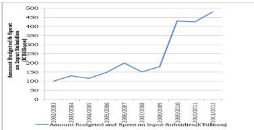
Figure 1: Input Subsidies Budgetary Allocations (K'Billion) 2002/2003 - 2011/2012

Source: MAL - Implementation Manual 2012/2013 Agricultural season