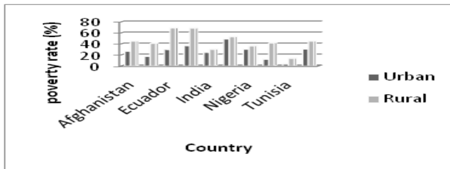
Fig. 2: Urban and rural poverty rate in developing countries